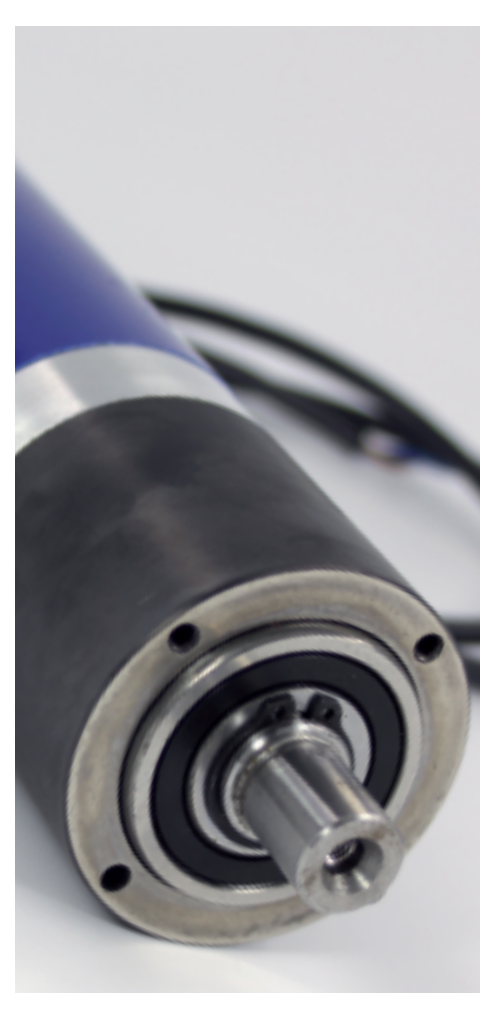
Your trusted partner for durable drive solutions since 1923