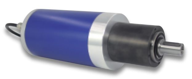
VGM8070 - GP75